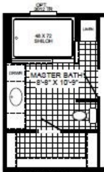
OPT. MASTER BATH